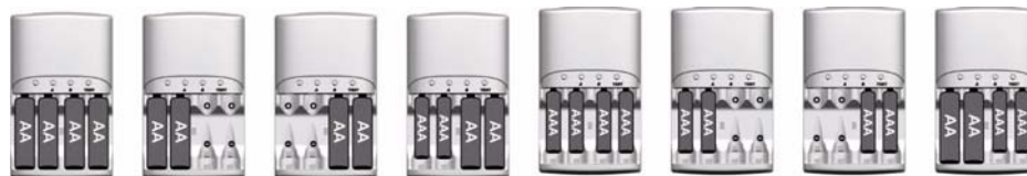
Available Charging Options.